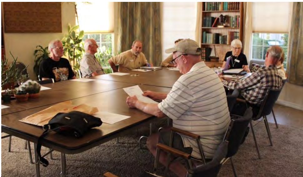
Members socialize before the meeting begins.