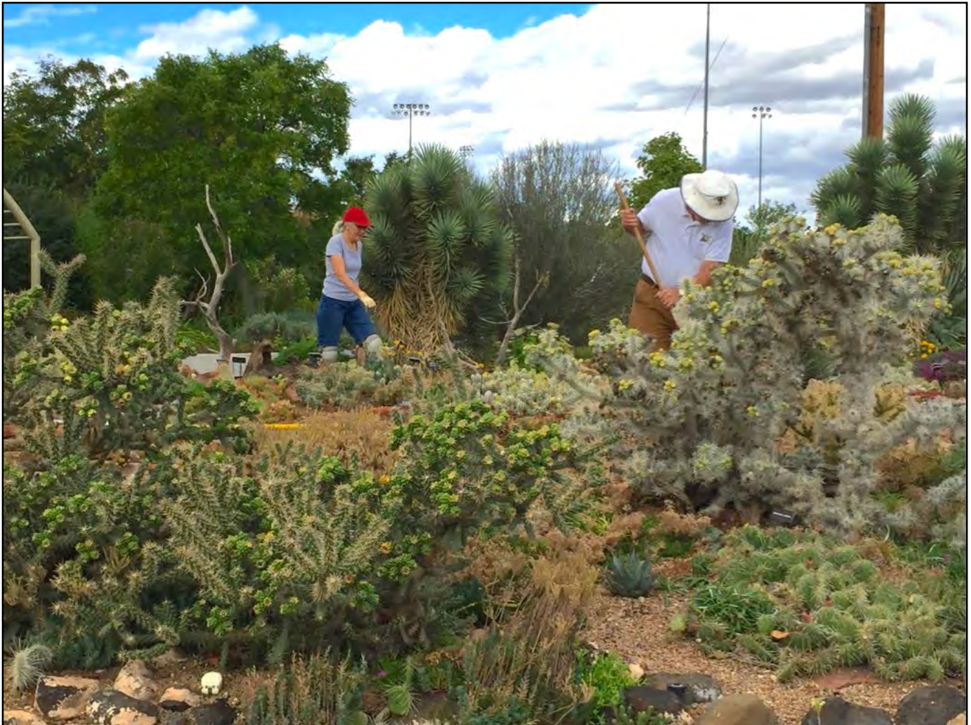
Chinle members survey their work at the CSU Extension Garden Sept. 17

Chinle Cactus and Succulent Society usually meets the 2 nd Thursday of each month at 6:30 pm. Meetings are held in the Western Colorado Botanical Garden Library, 641 Struthers Ave., Grand Junction, CO. Guests are always welcome. Chinle Mailing Address: Chinle Cactus & Succulent Society, PO Box 233, Grand Junction, CO 81502 CHINLE C&SS WEBSITE: www.chinlecactusclub.org