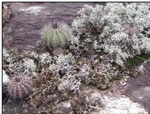
Uebelmannia in natural habitat.

The diurnal yellow flowers come sporadically. They are 0.6 inch long (15 mm), 0.5 inch in diameter (12 mm).