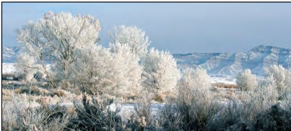
Brrrr! Looking toward the Bookcliffs in January shows winter's frosty presence!