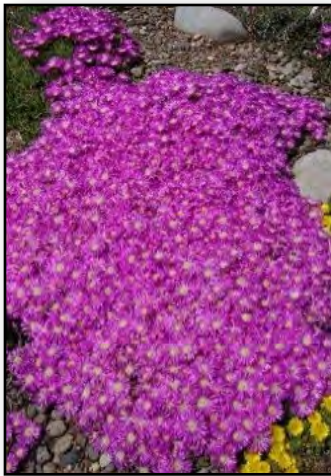
Delosperma sp Tiffendell

Here is a pretty amazing patch of an ice plant from the highest mountains of the East Cape Drakensberg, the Delosperma sp Tiffendell—which is likely to prove very hardy in mountain gardens as well.