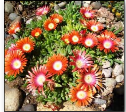
Delosperma dyeri , orange form

Delosperma dyeri (the cultivated clone ‘Red Mountain’ which is a darker red—dazzling in its own right.) On the right is the Delosperma dyeri (orange form).