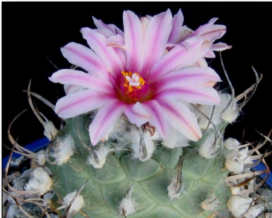
Lovely Turbinicapus schmidickeanus , blooming in Don Campbell's greenhouse on 1-18-13.