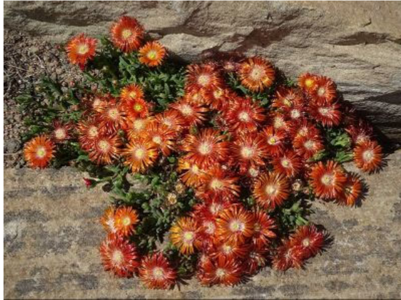
Delosperma 'Granita Orange'.